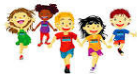
Image Musical Theatre